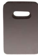
MAT5000 4"x16" one knee kneeling