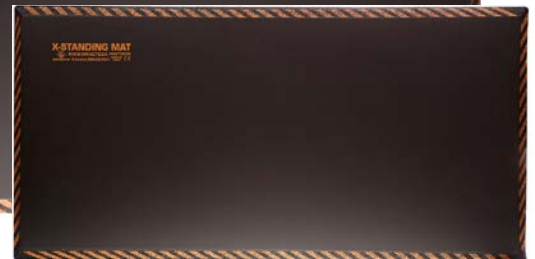
X-Standing Mats have beveled safety edges MAT5020 16" x 28" MAT5030 18" x 36"