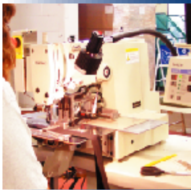
Electronic Pattern Sewer

experience is required to operate the Pattern Sewer, thus freeing up skilled stitchers to perform other tasks."