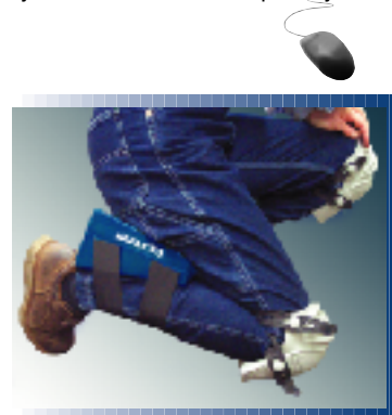
890-00 Knee Saver

The IMPACTO 890-00 Knee Saver™ helps relieve strain on knee joints, tendons and cartilage and features a unique molded design that prevents slipping. It limits the range of knee movement and supports the buttocks, like a seat and has adjustable elastic straps that enhance wearer comfort. The Knee Saver can be utilized in any work or recreational environments where squatting or kneeling is required. The 890-00 can also be worn in unison with any of the IMPACTO kneepad styles.